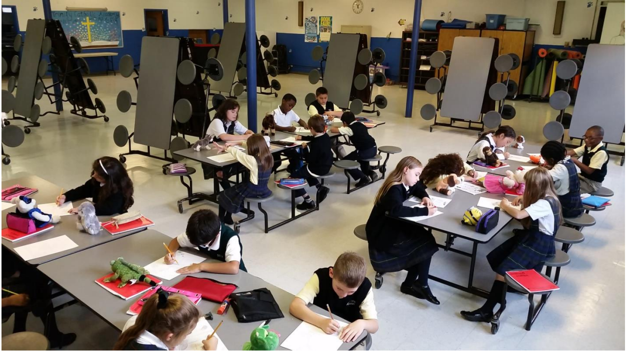
Third Grade working hard on their awesome drawings!