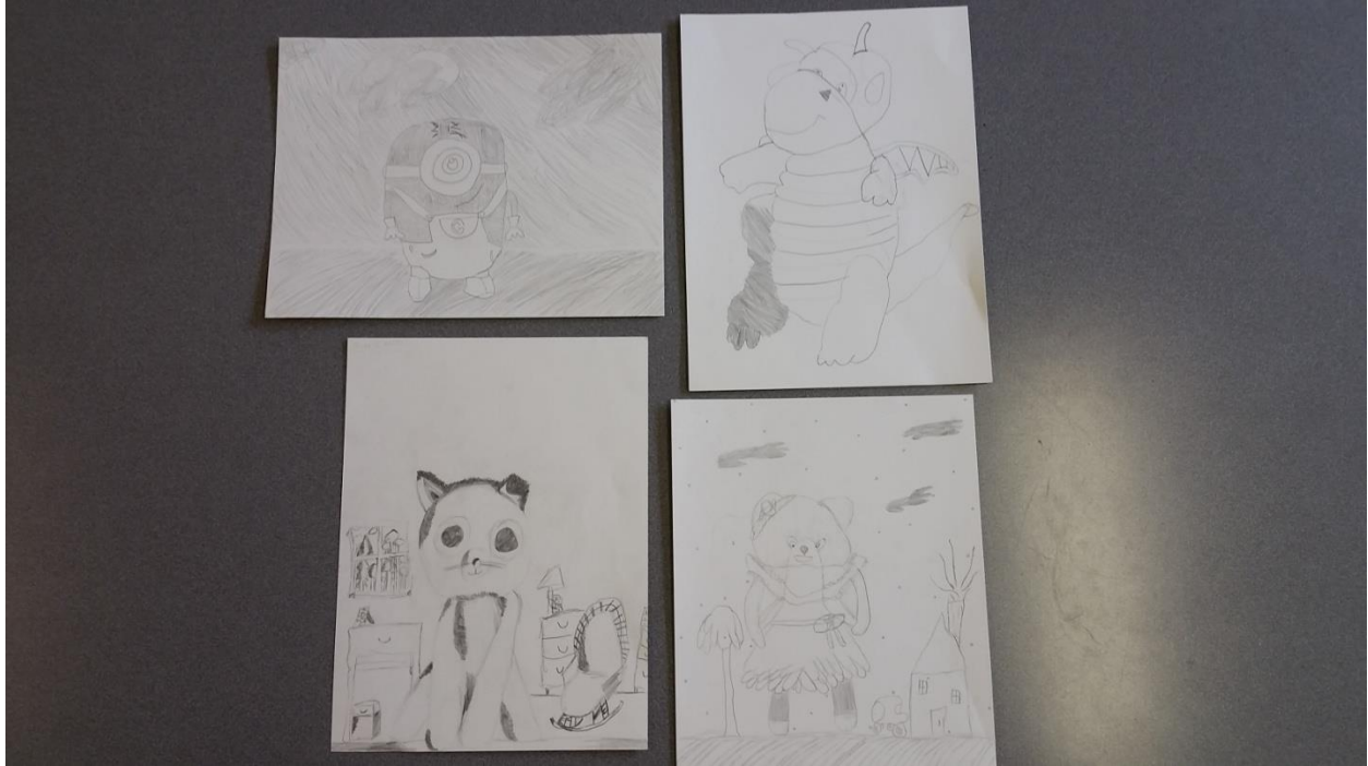
Third grade - Stuffed Animal Still-life (examples: works in progress)